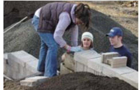
Above: Students working on the 2nd retaining wall to our lower entrance.